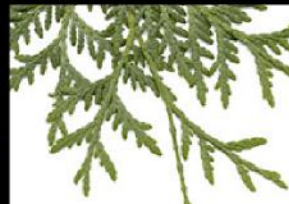
Eastern White Cedar